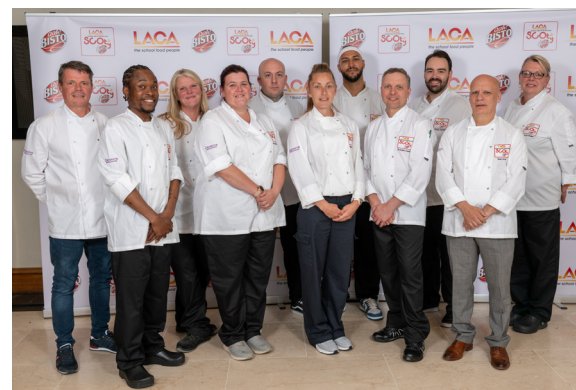
SCOTY 2023 finalists